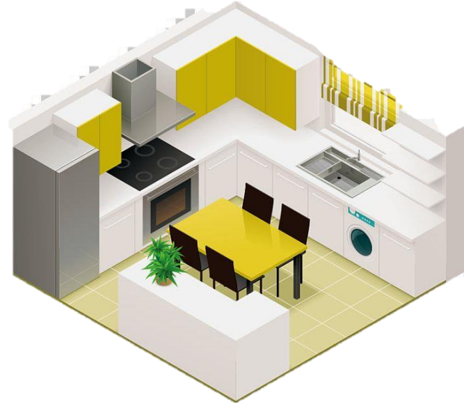
Certification in Kitchen Design