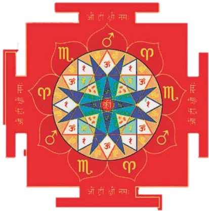
Certification in Vastu Shastra in Interior