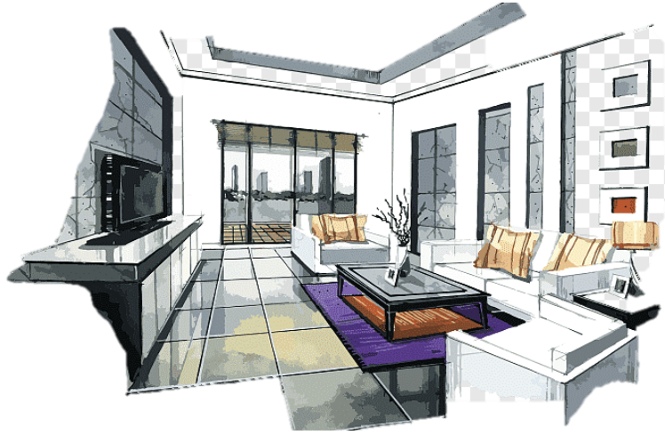
Certification in Interior Styling