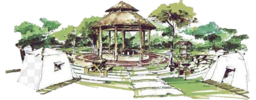
Certification in Landscape Design